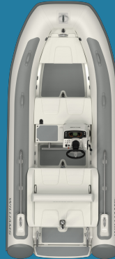
435 7 PERSONS