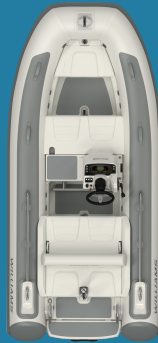
395 6 PERSONS