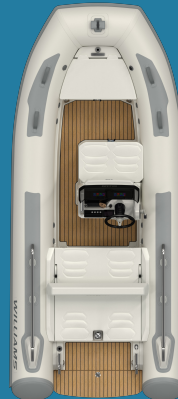
460 6 PERSONS