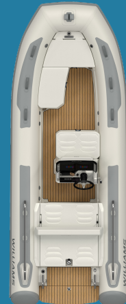
520 7 PERSONS