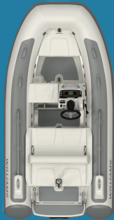
345 5 PERSONS