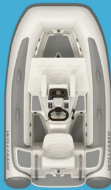
— 285 — 3 + 1 PERSONS