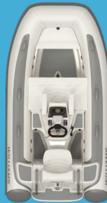
— 325 — 4 + 1 PERSONS